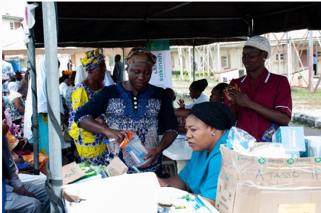
Drug Dispensation Unit