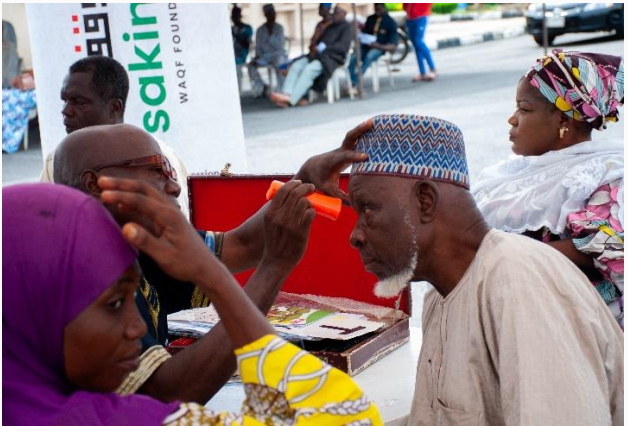
Free Eye Screening Area