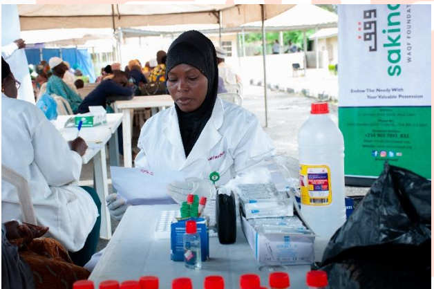
Sample Collection Tent (For Lab)